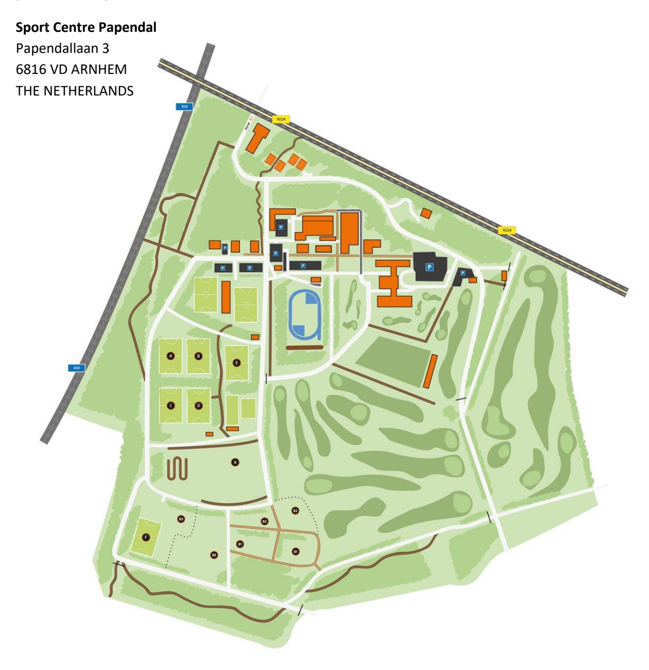
Ground plan Sport Centre Papendal

From young promising athletes to world class athletes, the possibilities for (elite) sport are unlimited at Papendal. With its extensive experience, Papendal has been a very professional and reliable partner. Due to their wide knowledge of the requirements and demands of (elite) sport Papendal always performs at top level.